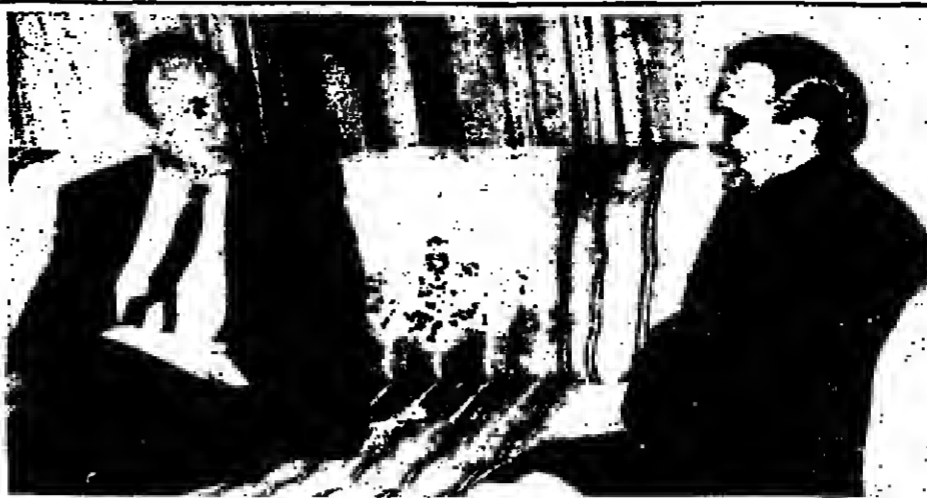
MEETS ZIA: West German Foreign Minister Hans Dietrich Genscher (left) during his meeting with Pakistani President Gen. Zia ul-Haq Tuesday evening.

A majority of the world's nations are in the nonaligned movement, but not the major industrial or Communist powers that are in military alliances such as NATO and the Warsaw Pact. Cuba is a member. The group met in New Delhi last week. Regarding Israel, it said its actions were intended to punish Israel for violations of international law in the occupation of Arab territory and in the annexation of Jerusalem.